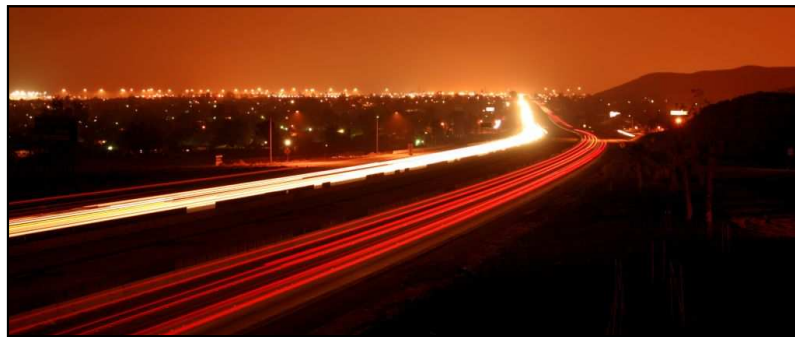
Moreno Valley is one of TRANSIMS' newest users and was recently named one of the fastest-growing cities in the nation.